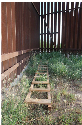
Figure 4: Ladder on the Border Wall in the Rio Grande Valley circa 2016