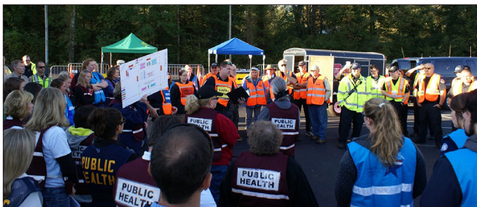
Figure 1: Participants in a Biological Incident Exercise

GAO-22-105733