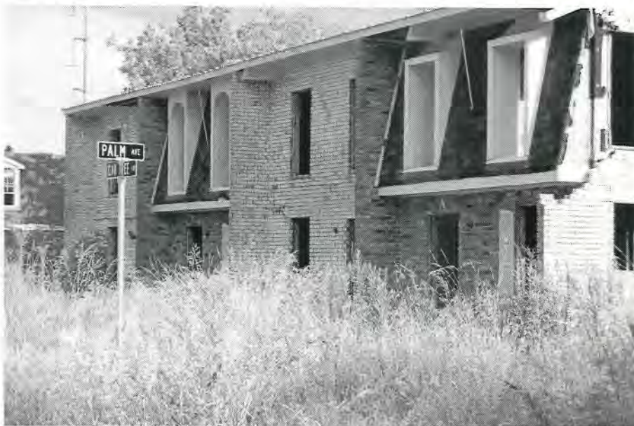
Figure 2: Replacement Street Signs Facilitated Address Canvassing in New Orleans