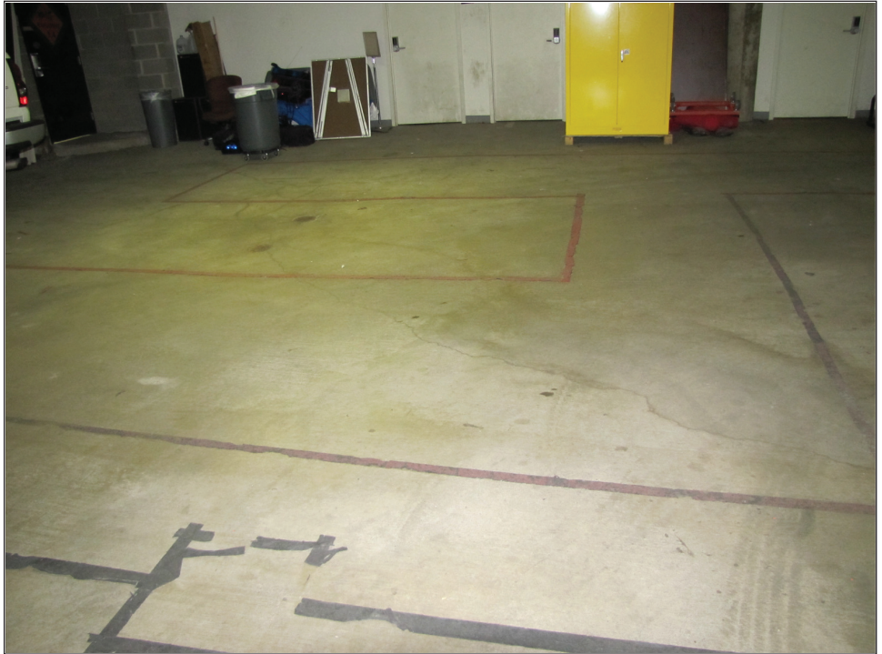
Figure 3: Simulated Tape Walls Used in Training