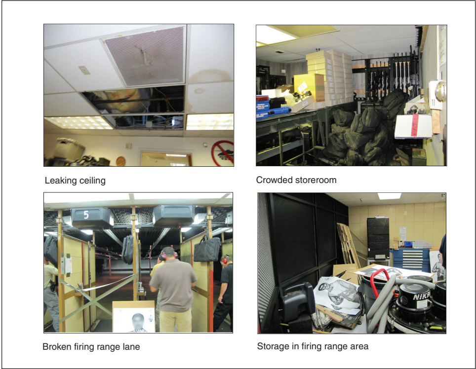
Figure 2: Disrepair and Crowding at State Annex-7

State Annex-11 to simulate walls for conducting room-entry training (see fig. 3).