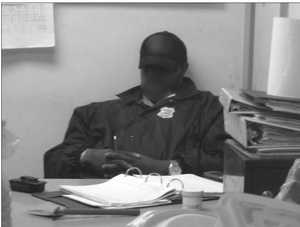
Figure 2: FPS Guard Sleeping at Post