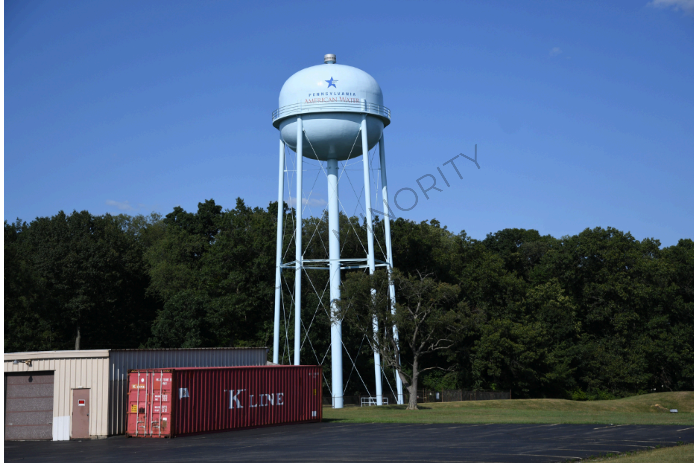
Ground of AGR Building - Water Tower