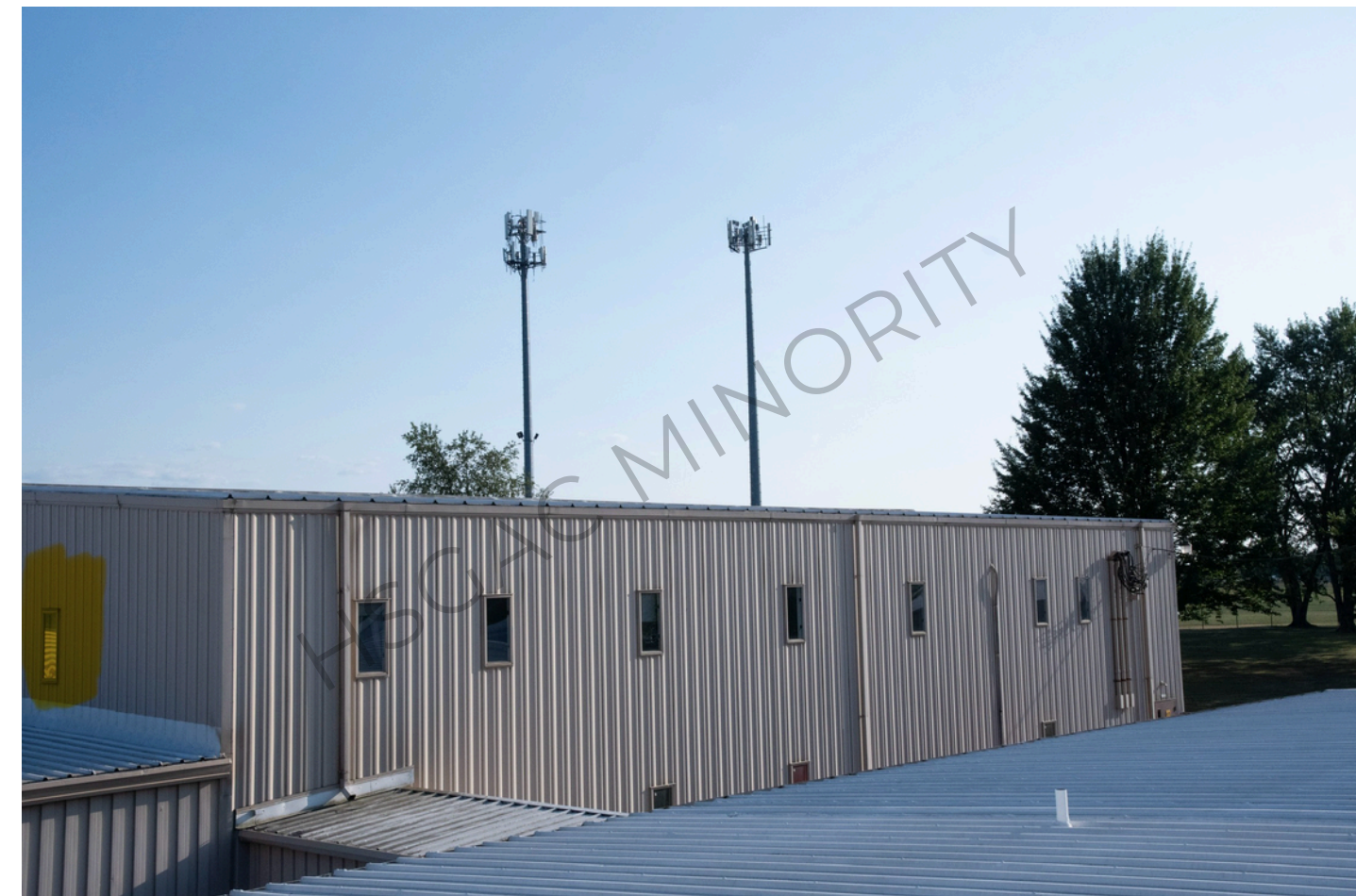
Rear of AGR Building roof from window