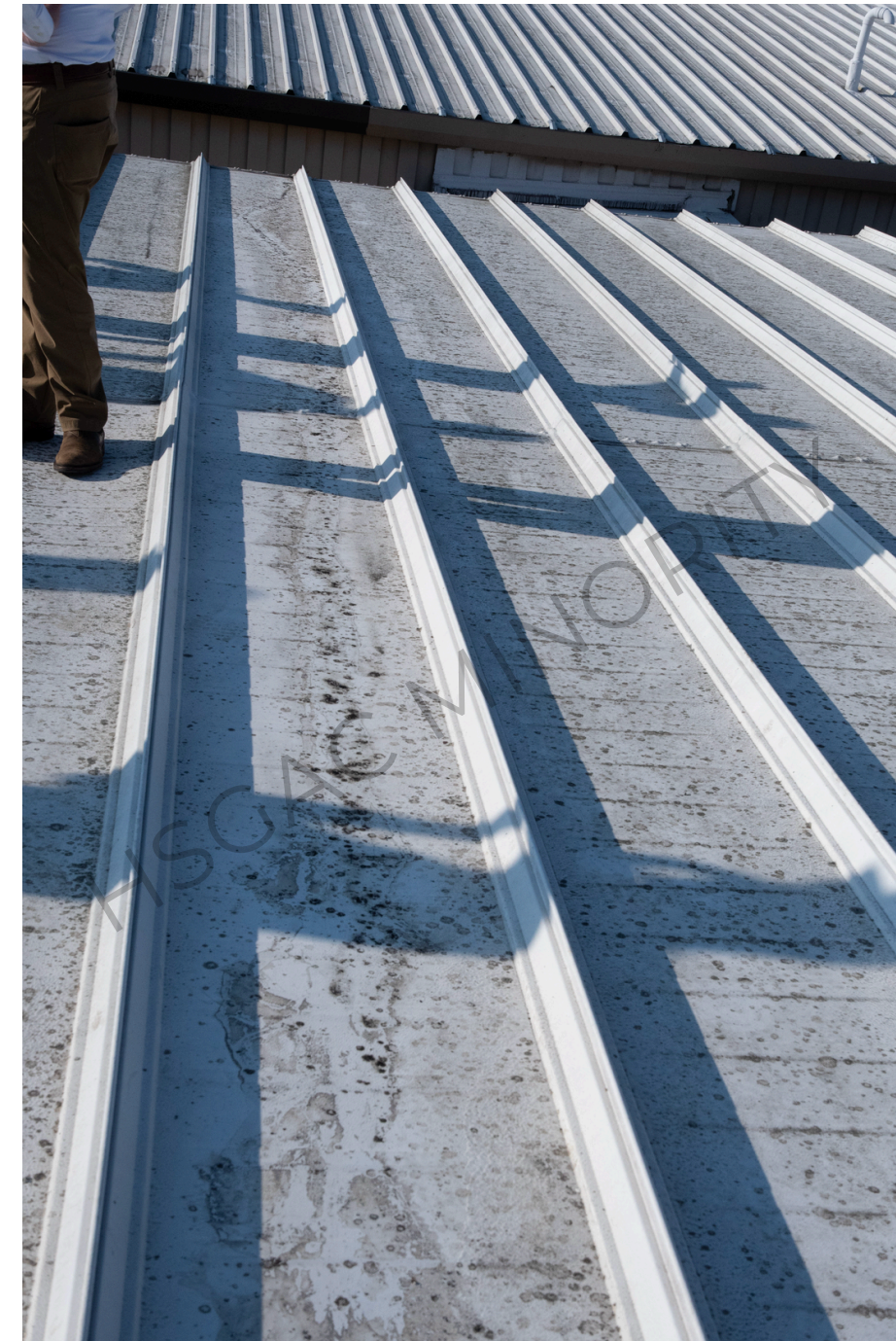
Views of Shooter Thomas Matthew Crooks' Shooting Position