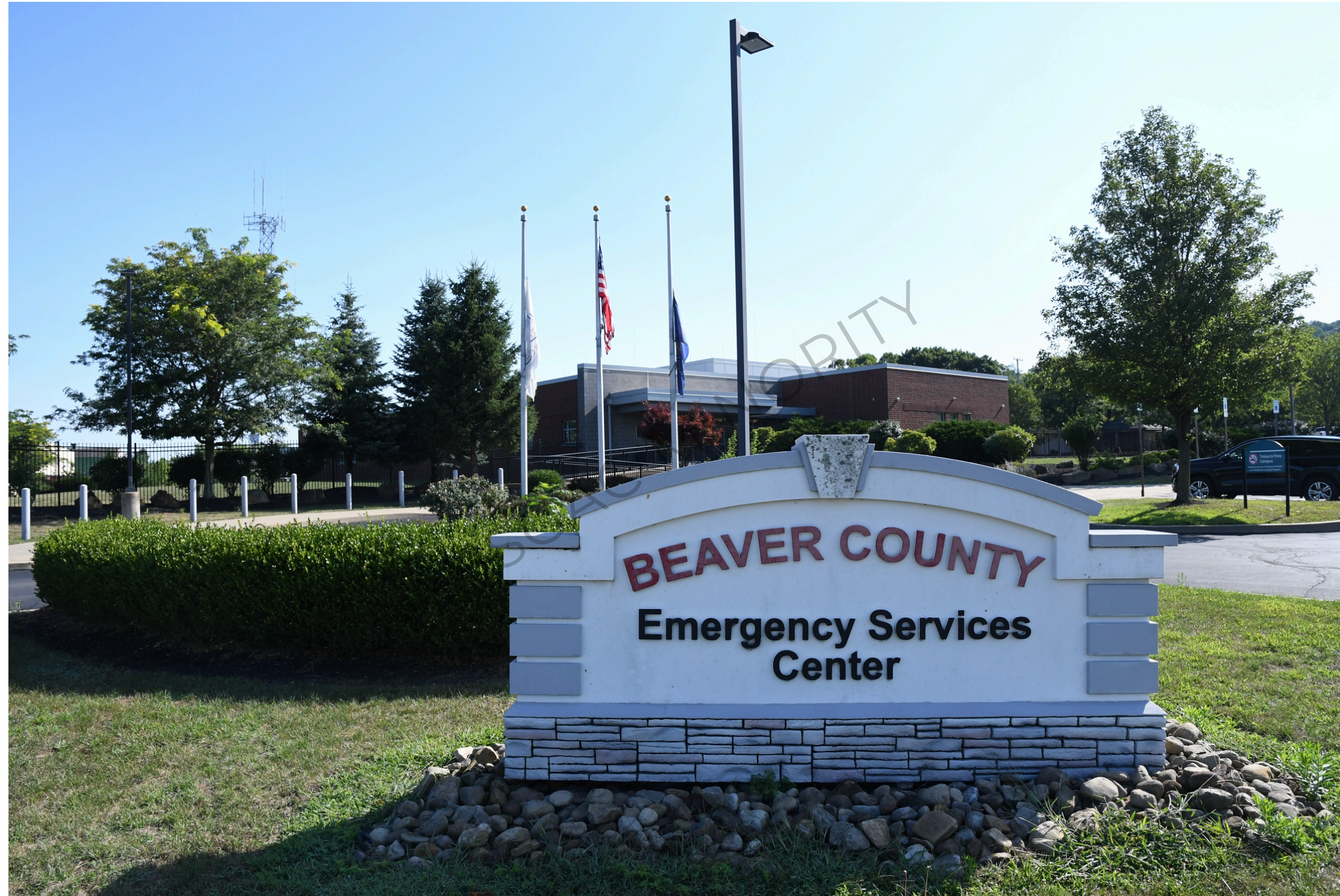
Beaver County Emergency Services Center