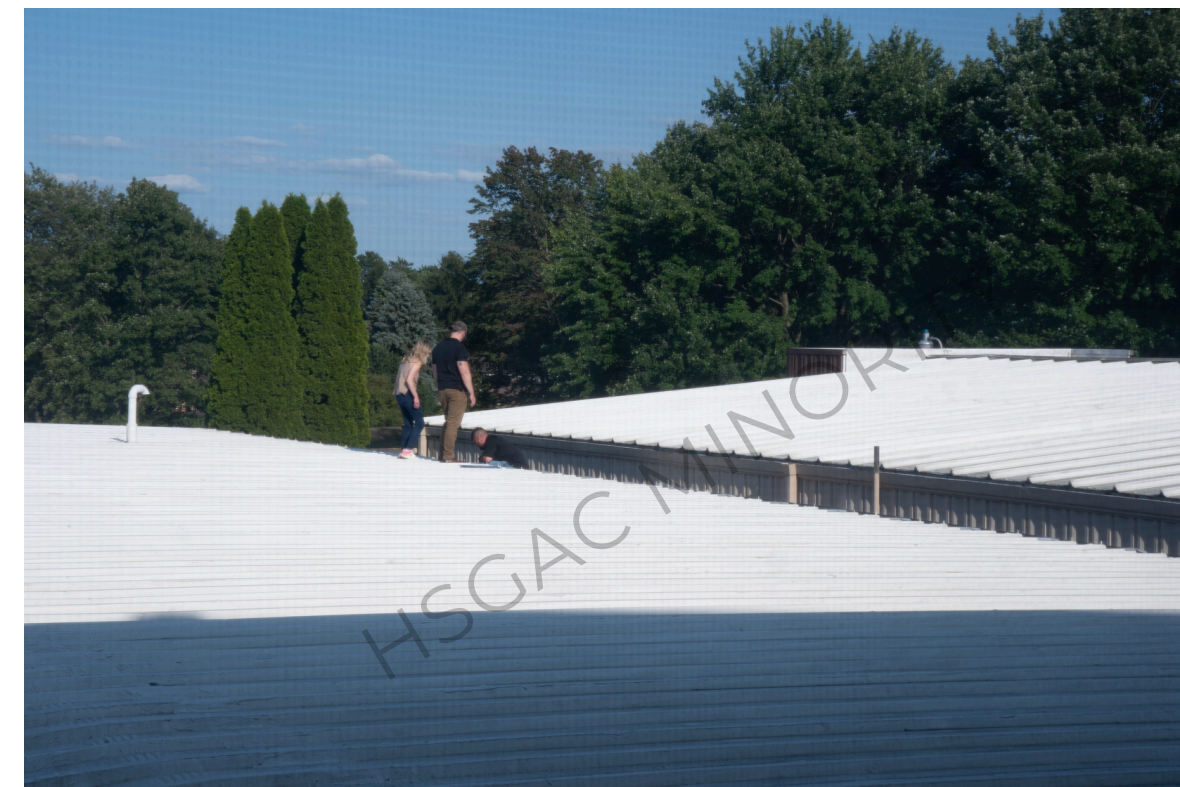
Rear of AGR Building roof from window