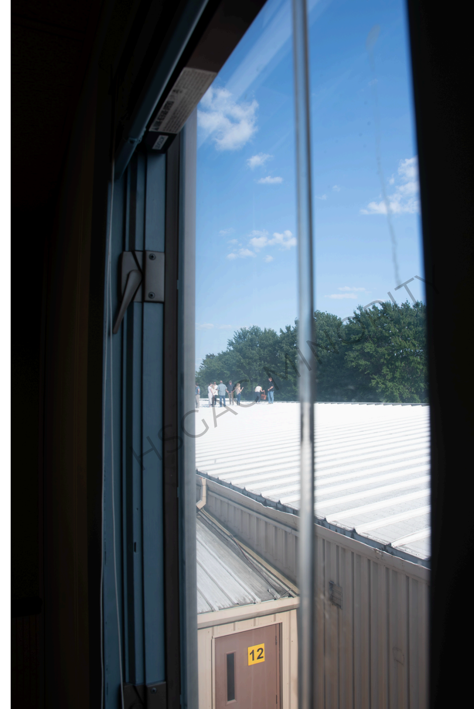
Additional views of AGR Building roof from another window