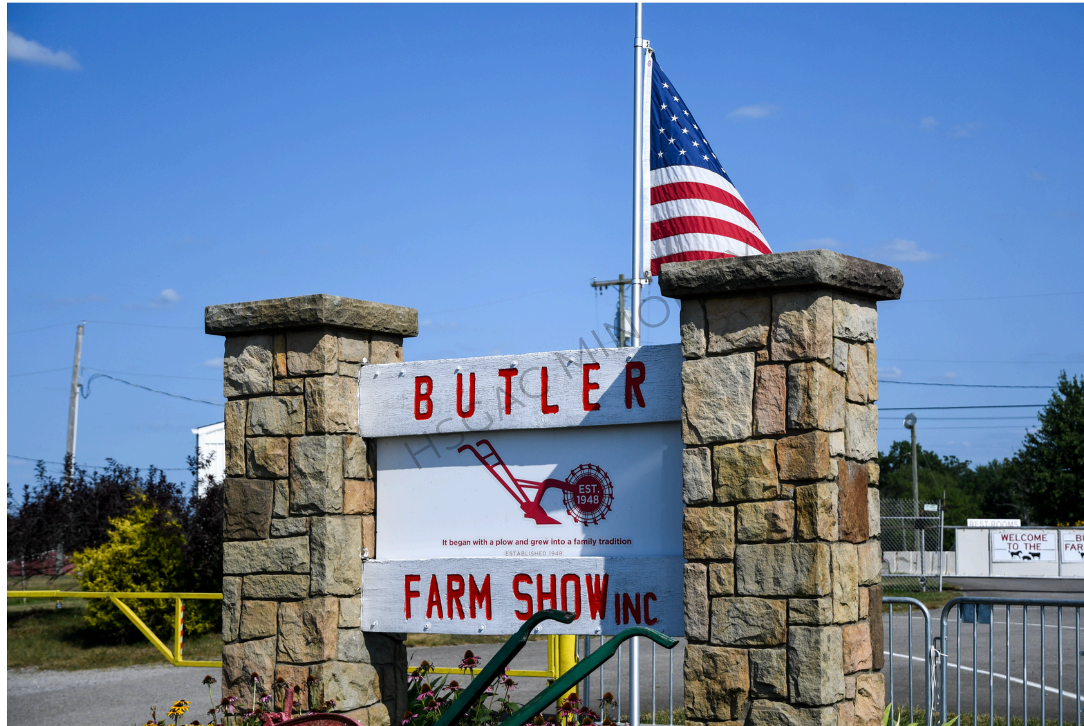
Entrance to Butler Farm Show