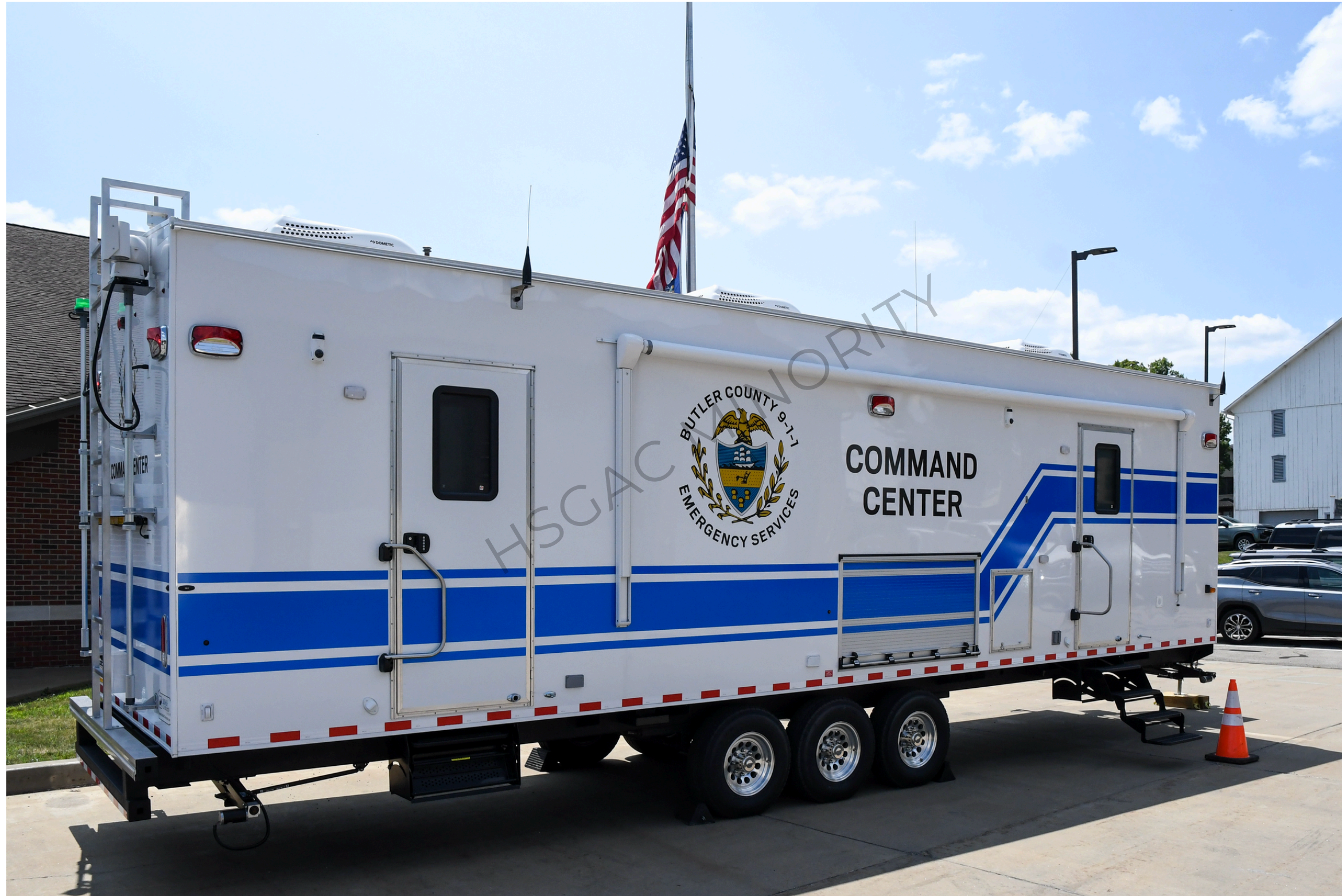
Butler County Emergency Services Command Center