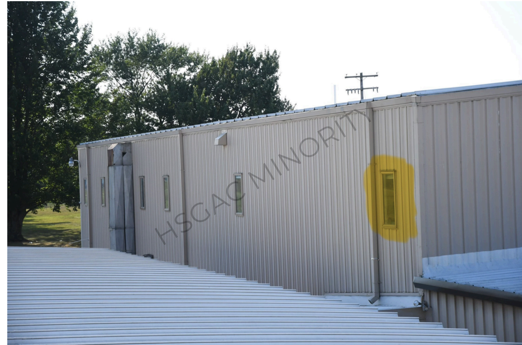
View of AGR Building roof from window closest to Crooks' shooting location