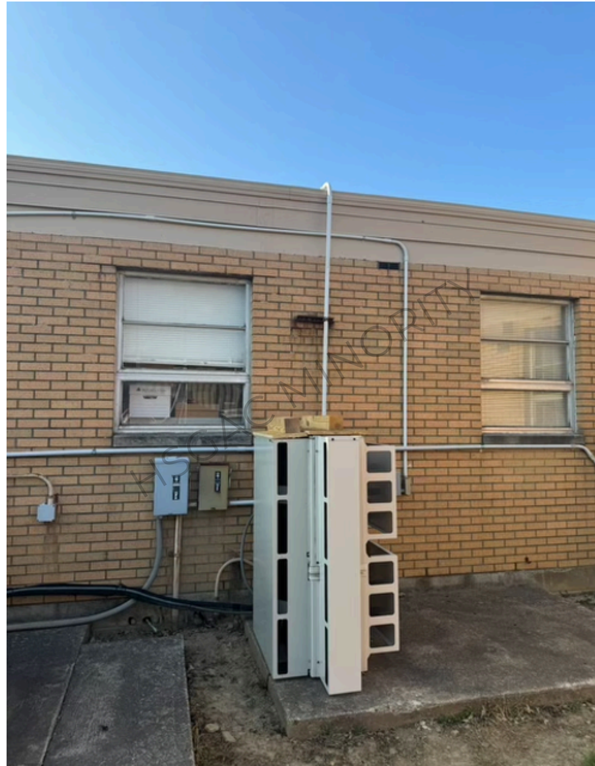
Rear of AGR Building - Potential roof access point for Crooks (Top of HVAC Unit Removed by FBI for Analysis)