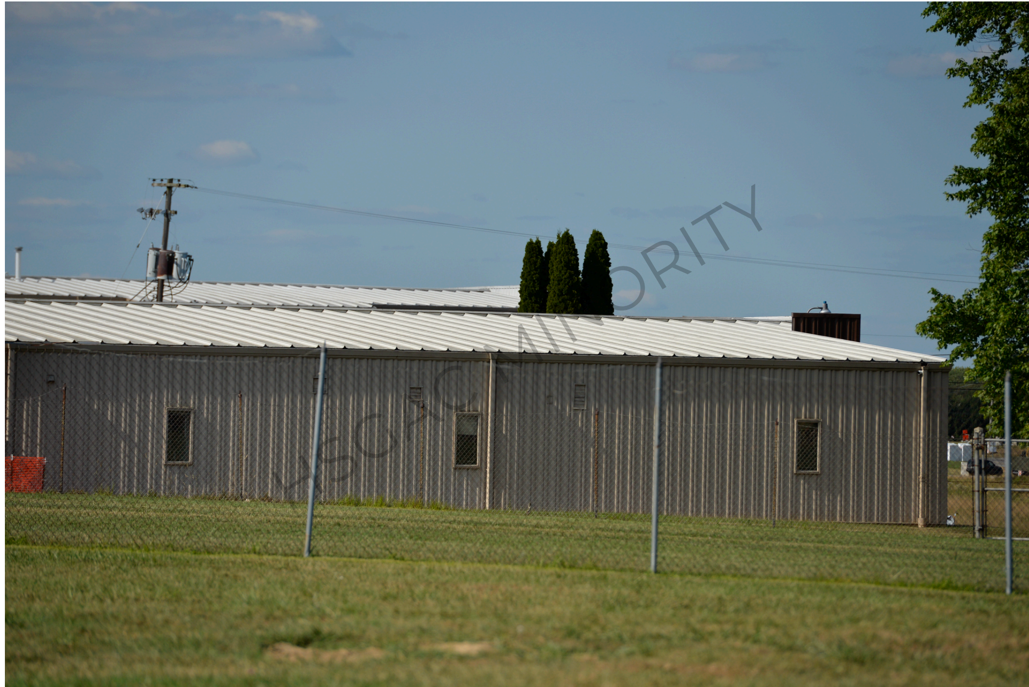
Closer view of AGR Building Roof