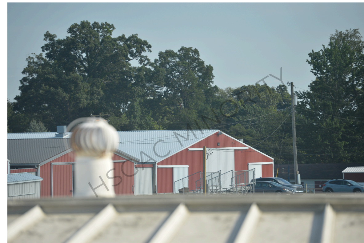
View of AGR Building roof from another window