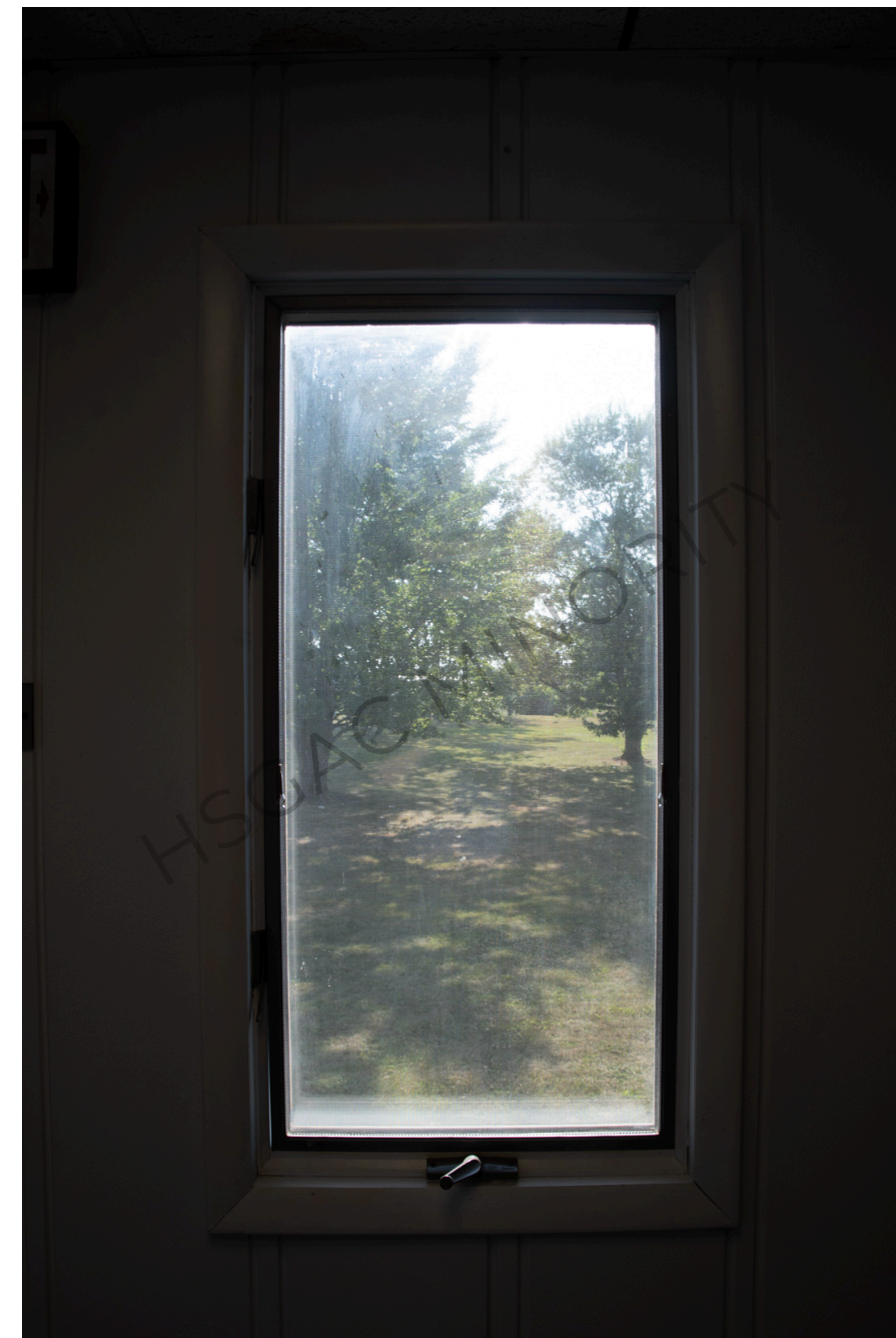
AGR Building window - Side of AGR Building