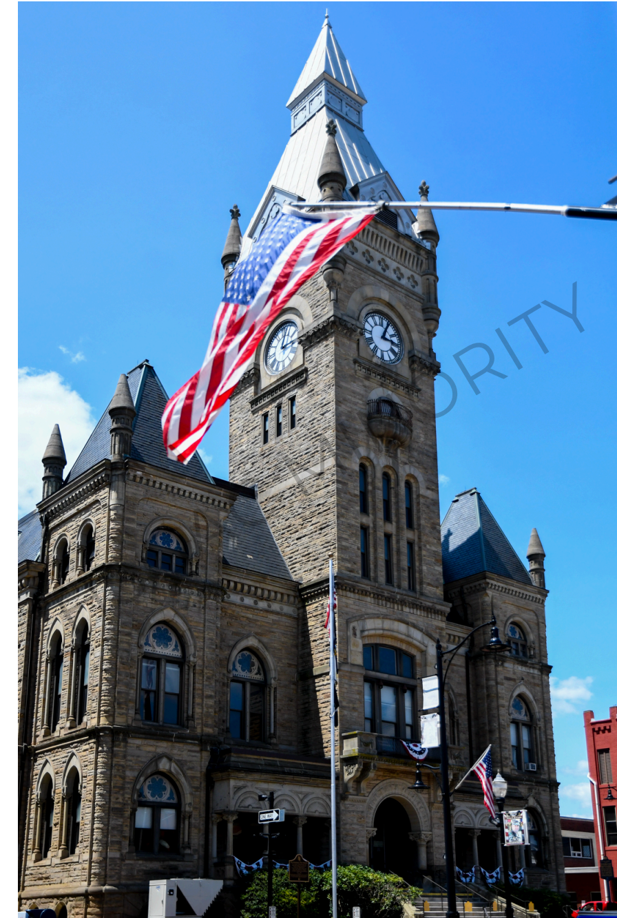
City of Butler