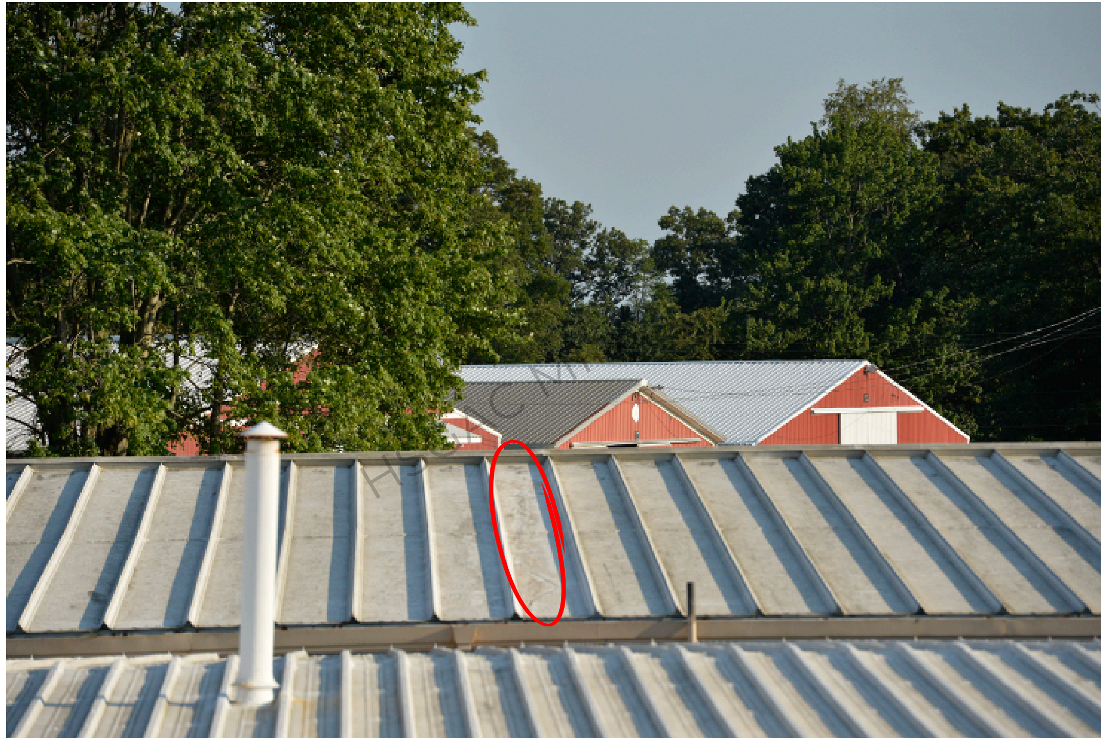
Rear of AGR Building roof - Crooks had to crawl through to get to shooting position