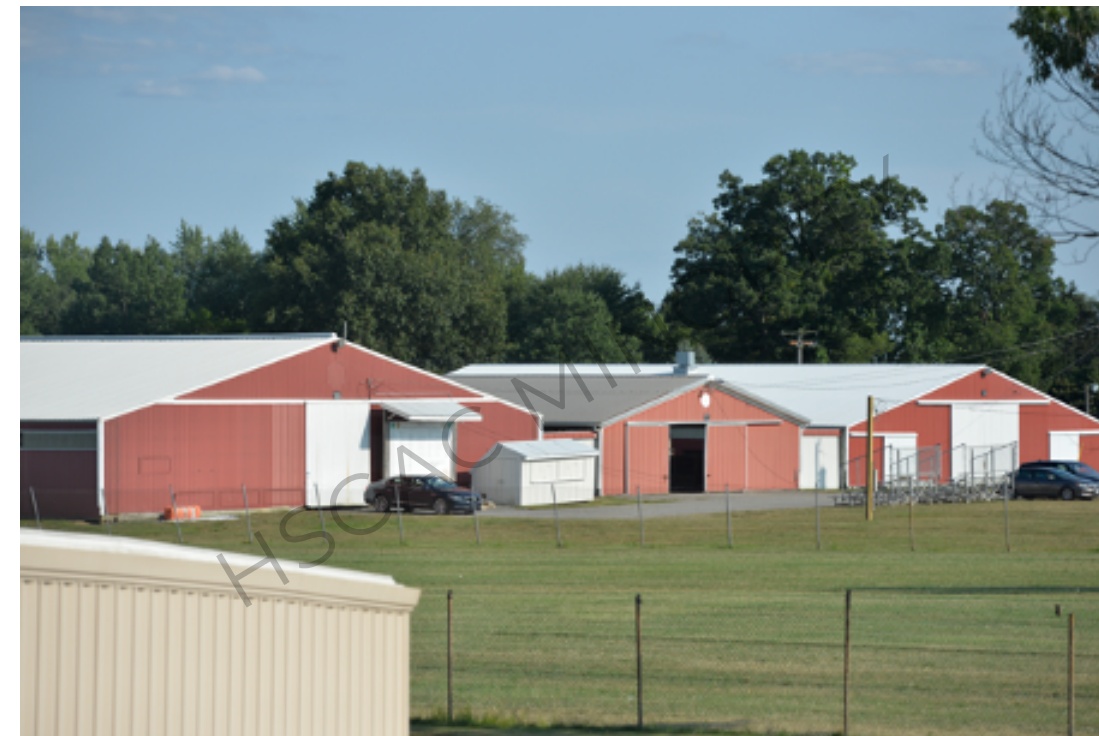
AGR Building window - Butler County Sniper first spots crooks (Red Circle)