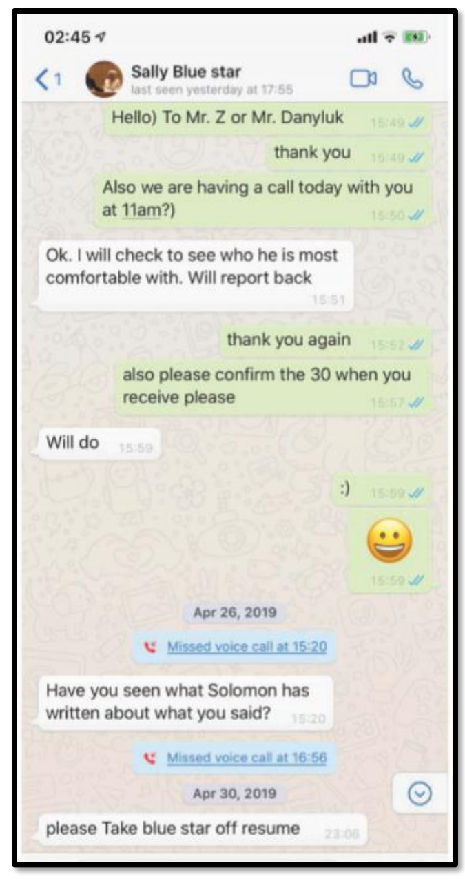
Messages exchanged between Sally Painter (white background) and Andrii Telizhenko (green background)<sup>196</sup>