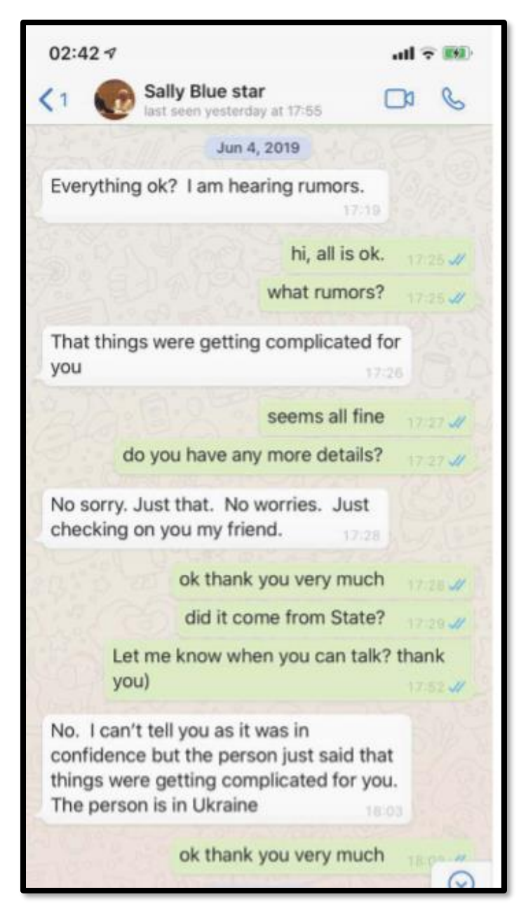
Messages exchanged between Sally Painter (white background) and Andrii Telizhenko (green background)<sup>197</sup>