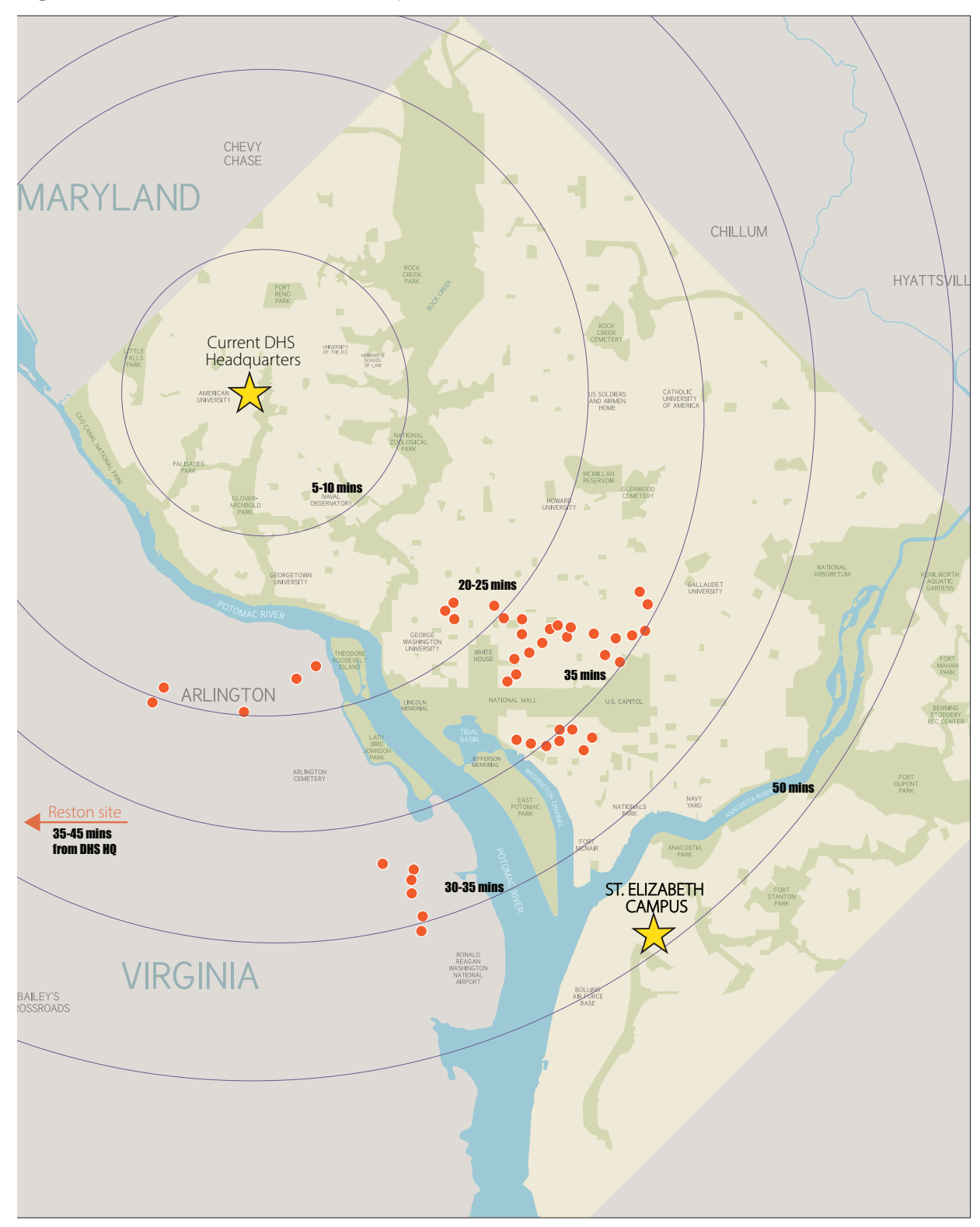
Figure 4: Travel Time from DHS Headquarters