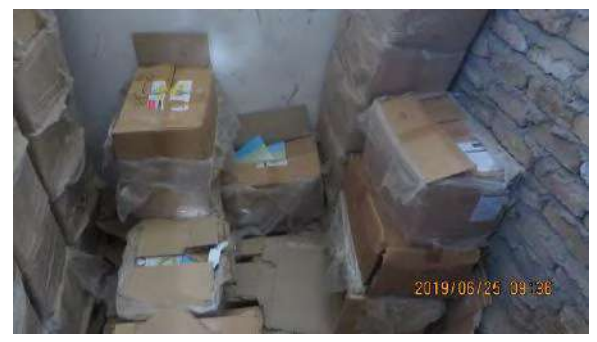
Some of the 154,000 USAID-funded textbooks sitting in storage, with these located at the Herat Field Office in Enjil, Herat, Afghanistan.

There appears to be more to the story, however, as a review by the Special Inspector General for Afghanistan Reconstruction (SIGAR) found in part that "[p]rincipals and teachers at a quarter of the schools inspected stated, 'that the books were no longer in usable condition.<sup>3988</sup> Along the way, SIGAR also found significant "book quality deficiencies, such as, loose or blank pages, misspellings, and low quality paper.<sup>389</sup>