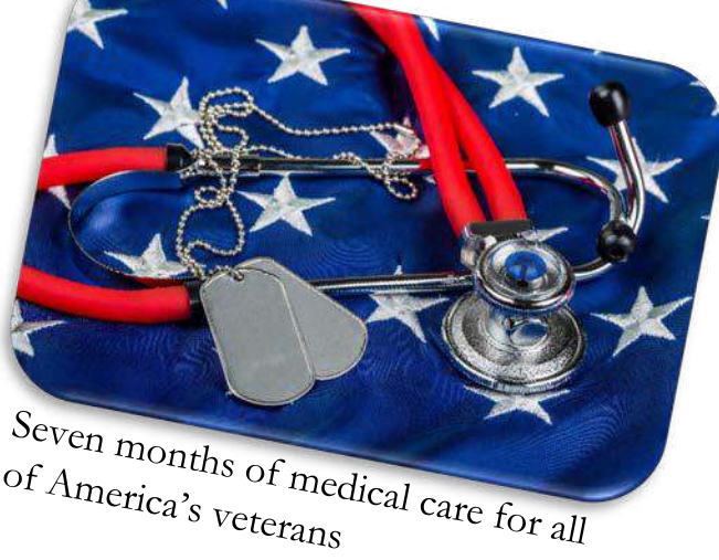
of America's veterans

Six years of the entire federal court system