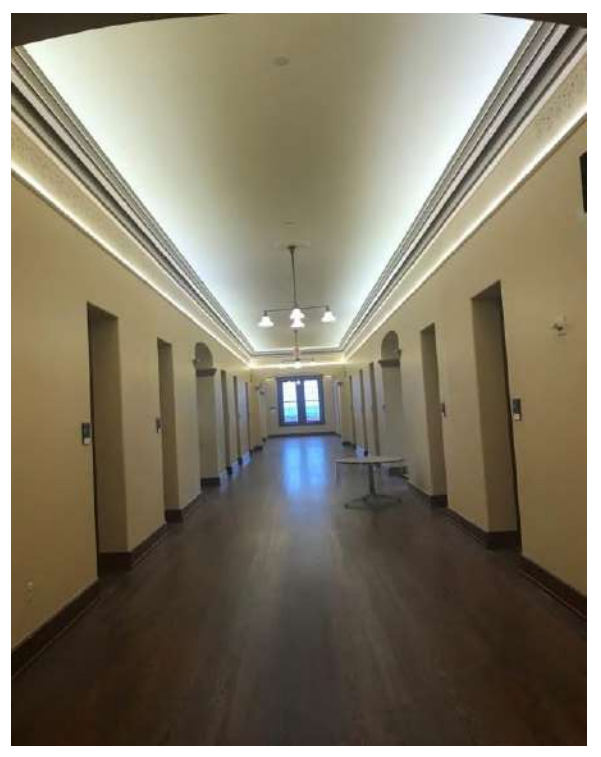
Photo of a hallway in the main DHS facility at St. Elizabeths. Each door leads to an office that used to be a bedroom in the mental hospital.

Because the entire site is an historical landmark, GSA has had to work around D.C. preservation regulations, including maintaining the exterior façade of key buildings.<sup>15</sup> So when GSA and DHS gutted the interior of the buildings, they kept the exteriors intact to use as shells for newly constructed buildings within the walls of the originals.<sup>16</sup> In 2010, GSA learned the buildings lacked adequate