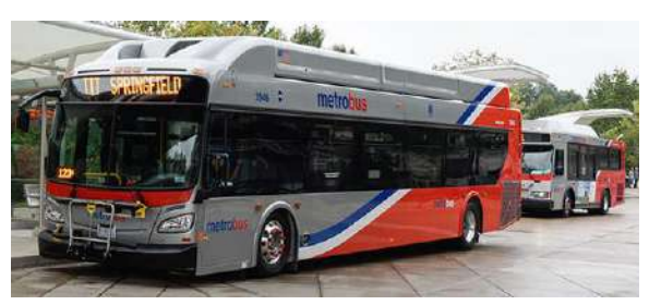
Metro says, 'Use Lyft!'

service at that time, called its "After Midnight Service." <sup>22</sup> While Metro cited schedule changes in its rail service as the reason for the program,<sup>23</sup> the development was not exactly universally praised by those targeted.<sup>24</sup>