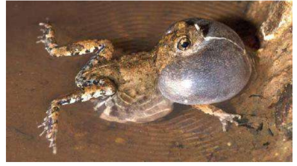
Túngara frog mid-mating call. Photo Credit: The Scientist.com and Ximena Bernal <u>https://www.the-</u> <u>scientist.com/notebook/these-flies-hijack-frogs-love-</u> calls-30193.

So what did the researchers determine? In short, urban life seems to have benefited the male frogs, who "call at higher rates" and have a more complex, attractive mating call than their forest-dwelling counterparts.<sup>70</sup> While the male urban frogs "experience higher competition for mating opportunities," they also face less risk from predators.<sup>71</sup>