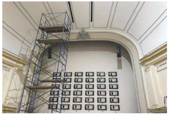
Photo of the auditorium on site at St. Elizabeths. Despite being inside the secure perimeter, the public will maintain access to it after DHS moves into the facility.

Meanwhile, there are portions of the site which are "restricted for development" due to historical and environmental concerns.<sup>19</sup> GSA and DHS have also agreed other portions of the site – inside the secure perimeter – must remain open to the public.<sup>20</sup> The surrounding community will maintain access to the site, albeit on a limited and supervised basis, to visit a hilltop from which community members traditionally watch Fourth of July fireworks, visit the cemetery on site, and use an auditorium.<sup>21</sup>