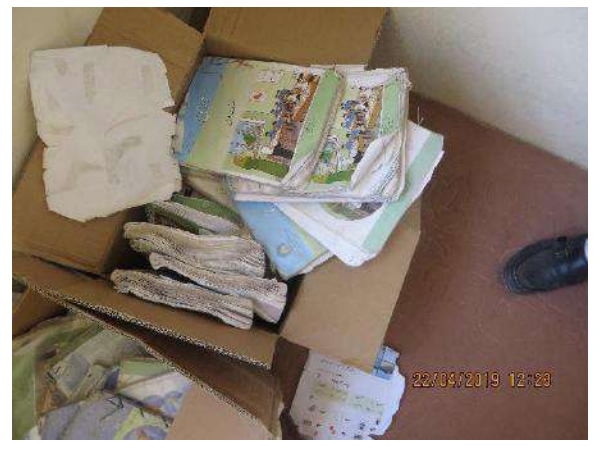
Unusable textbooks at an Afghan school, paid for with Americans' tax dollars.

The failure was part of USAID's Afghan Children Read (ACR) program, a 5-year program taking place from April 2016-April 2021 (with the full cost expected to clock in at $69,547,810).<sup>85</sup> According to USAID, the ACR is a joint effort between it and the Afghan Ministry of Education (MoE) "1) To build the capacity of the MoE to develop, implement, and scale up a nationwide early grade reading curriculum and instruction program in public and community-based schools; and 2) To pilot evidence-based early grade reading curricula and instruction programs to improve reading outcomes for children in grades one through public and community-based three in schools."86