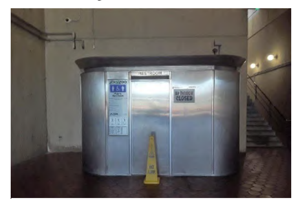
Photo of the half-million-dollar toilet facility. Metro left the facility broken for two years before taking it out of the Metro station.

To top it off, the half-million-dollar toilet sat broken and abandoned in the Huntington Station from 2017 to early 2019.<sup>32</sup> Metro contracted with a private company to clean and maintain the selfcleaning toilet but canceled the contract in 2017.<sup>33</sup> While Metro had plans to move the toilet to a different station,<sup>34</sup> it ended up decommissioning and removing the facility in early 2019.<sup>35</sup> FSO staff inquired about the current whereabouts of the toilet, but Metro was unable to provide an answer.